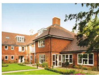
Lyefield Place, Kidmore End Road