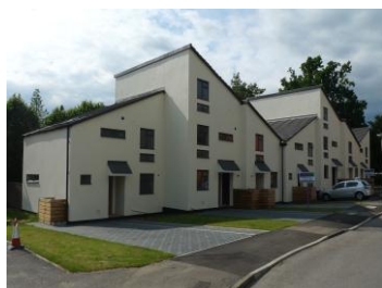
Field View, Derby Road

For more information and release dates please contact Damian Farmer on 0118 9461800.